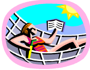
Summer and the reading is easy.

Library Board meets the 3rd Monday of each month at 6:30pm. Meetings are open to the public. No meetings in January and February.